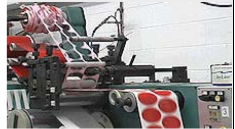
DIE CUTS TO SPEC

Customer Service: (888) 954-8804 service@BronAerotech.com