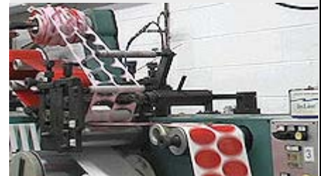
DIE CUTS TO SPEC

Customer Service: (888) 954-8804 service@BronAerotech.com